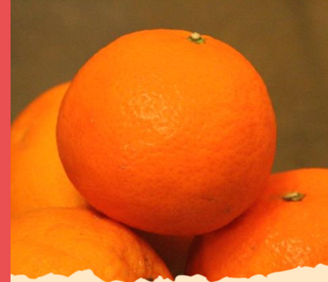
Citrus fruit or peels