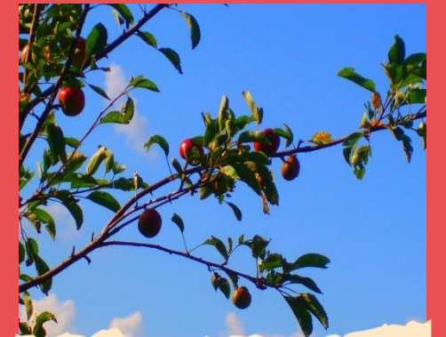
Twigs and branches