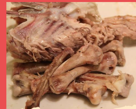
Meat, fish or bones