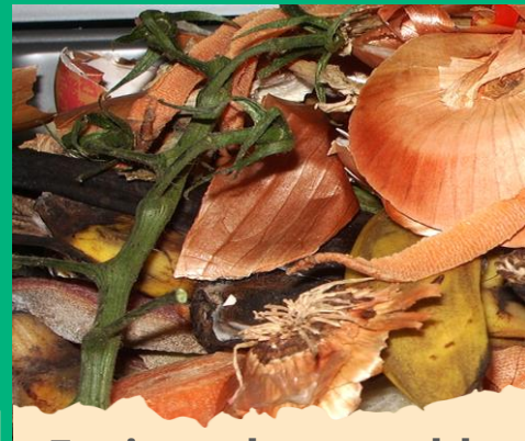
Fruit and vegetable peelings