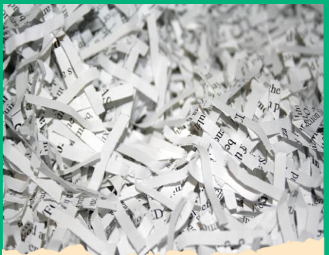
Shredded newspaper and cardboard