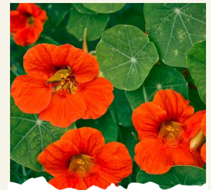
Ready for harvest

Water and weed regularly, especially over the warm summer months. Nasturtiums love to climb so guide them towards some trellis or build a bamboo wigwam to support them.