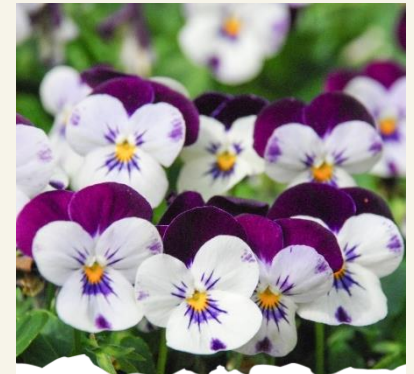
Ready for harvest