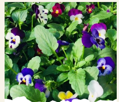
Ready for harvest