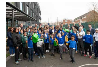
Mayor London Sadiq Khan visiting the Planting Healthy Air project that MOJU supported

another Planting Healthy Air school project. We have loved engaging the whole organisation by also including corporate volunteering opportunities for MOJU colleagues in and around London.