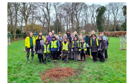
Tree planting in Bradford thanks to The National Lottery Community Fund

Funded by The National Lottery Community Fund, the Trees for Climate Action project has engaged close to 30,000 young people in Bradford and Glasgow. Led by Trees for Cities, it connects generations through tree planting, outdoor learning, and volunteering. Helping to build intergenerational bonds, stronger communities, and a legacy of thriving urban green spaces.