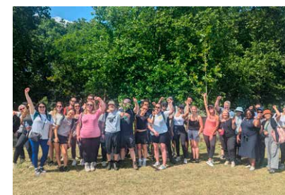
Bupa employees taking part at a Victoria Park tree maintenance day

Working together with organisations who share our mission and values enables us to make a bigger impact. Aligned by our shared goal of creating healthier cities, we are proud to deepen our partnership with Bupa Foundation. Highlights for 2024/25 include three projects to help improve woodland and green spaces across London and our Planting Healthy Air project at a Surrey school featured in their 'Healthy Cities' documentary.