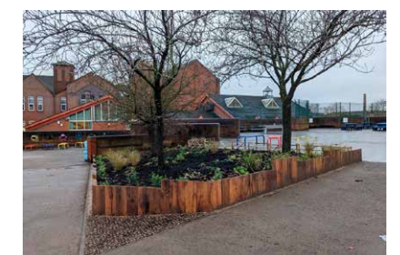
Abbey Mead Primary Academy with new Sustainable Drainage System

Working in partnership with local and national government is vital to ensure the long-term sustainability of our programmes. In partnership with London Borough of Lewisham council's Flood Alleviation team, together we developed and delivered innovative SuDs (Sustainable Urban Drainage Systems) in schools. We're thrilled to have been recognised as Highly Commended in the 2024 Susdrain Awards, thanks to a submission from our partners at the London Borough of Lewisham.