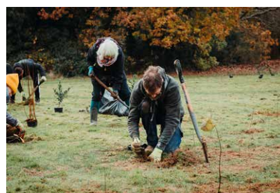
Planting at Bexhill as part of the Forgotten Places project, thanks to Players of People's Postcode Lottery

Unrestricted funding enables Trees for Cities to invest in programmes that are strategically important, pilot new approaches and sometimes take risks with new ideas. We are grateful to players of People's Postcode Lottery for their important funding. Support from players of the Postcode Lottery, and awarded by Postcode Green Trust in 2023, enabled us to embed our new senior leadership team, strengthen our wider staff structure, and invest in impact-led growth aligned with our tree equity goals.