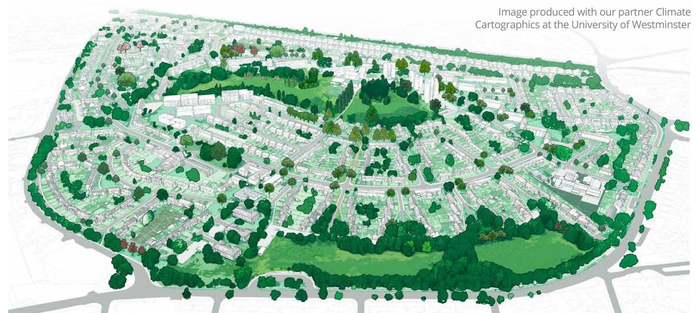
Image produced with our partner Climate Cartographics at the University of Westminster