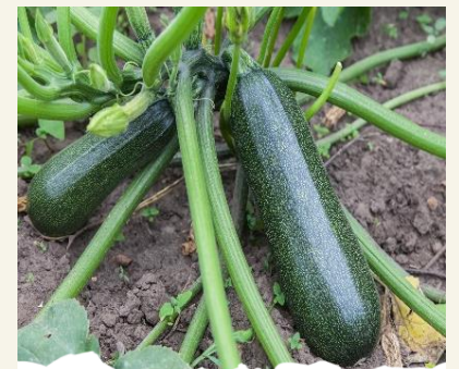
Ready for harvest